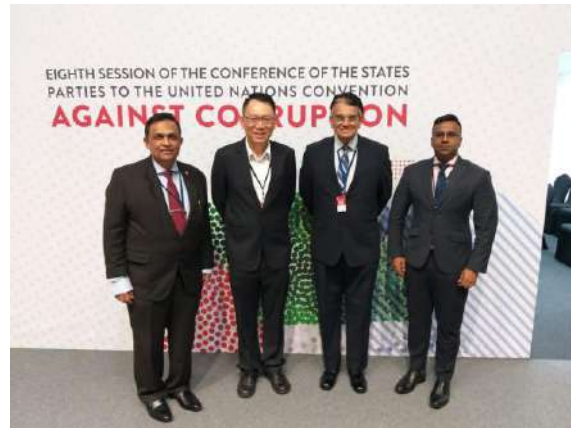
With the Singapore Delegation

28. The Singaporean delegation stated that the main reason for the success of Singapore was the political will of the leaders of the country. It was depicted that since Lee Kuan Yew days, the DNA of good values are so embedded in the people from their childhood and that their school syllabuses capture elements of gratitude and integrity. Accordingly,