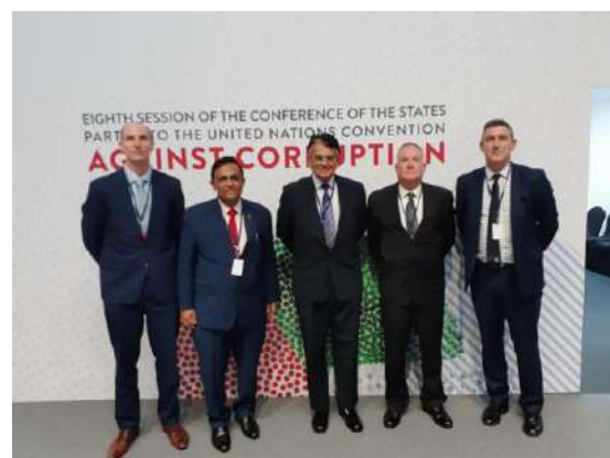
With the Australian Delegation

36. The Australian delegation comprising three investigators stressed on the power of prevention. Most importantly, the delegation stated that rather than relying too much on prosecutions they would refer the suspicious transaction for the disciplinary authorities to take disciplinary