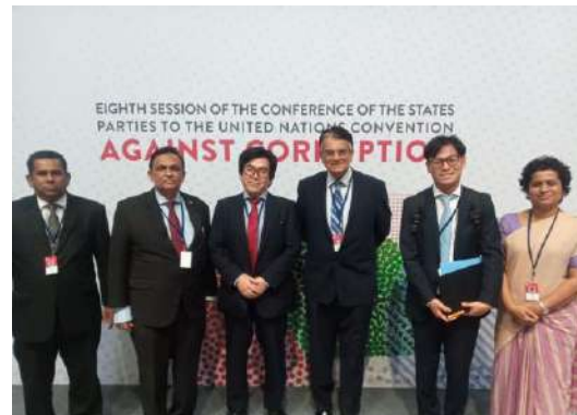
With the Japanese Delegation

35. At the bilateral meeting held with the Japanese delegation, it was stressed that they do not place full reliance on law enforcement or punishment. Instead they stated that from early school days the children are taught good manners, values including respect towards your neighbours,