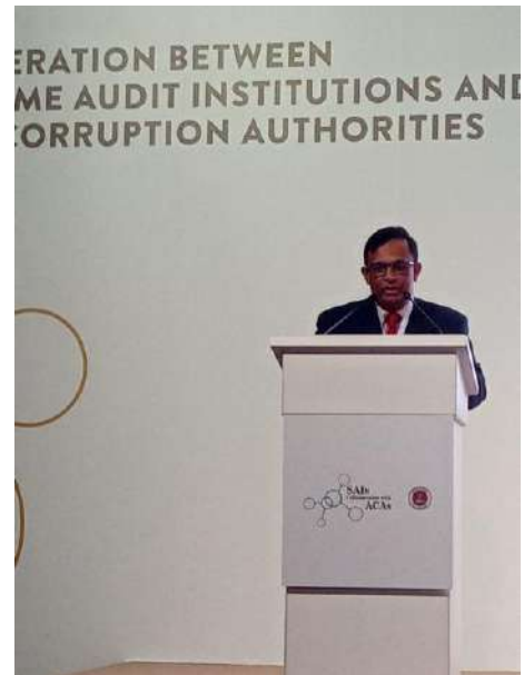
Director General addressing the panel on Supreme Audit Agencies and Anti-Corruption Agencies

23. On December 14 and 15 2019, the meeting on ‘Strengthening Collaboration between Anti-Corruption Authorities and Supreme Audit Institutions towards Effective Prevention and Detection of Corruption Offences’ was held in Abu Dhabi. It was organized by the State Audit Institution of the United Arab Emirates, as a Pre-Event of the Eight Session of the COSP. The meeting highlighted the importance of close and continuous cooperation between SAIs and ACAs as well as the beneficial effects of it. During the meeting the leading role of SAIs in deterring and fighting corruption was underlined; SAIs contribute to fostering transparency, evidencing risk areas, building robust and effective internal controls, specifically aimed at preventing corruption in line with the spirit of the UN COSP. Participants shared anticorruption strategies and reflected on risk assessments; they dealt with public procurement and public sector employment matters and discussed future workplans in combatting corruption.